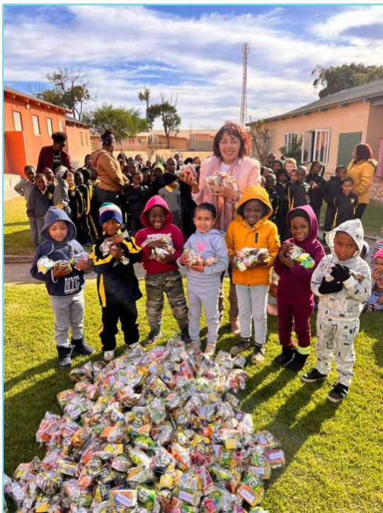
Principal & learners Ambrosius Amutenya Primary School