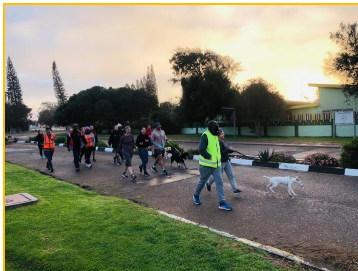
5km run/walk from Town Square

Everyone is welcome, young and old, families with wheelchairs, and well-behaved dogs on leashes.