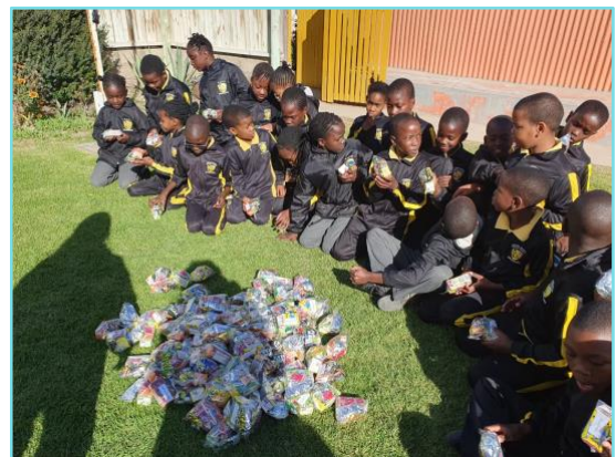
Learners from Ambrosius Amutenya Primary School

"The potential of Africa lies within the hearts and minds of its children." - Desmond Tutu