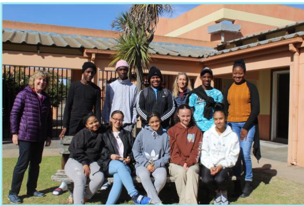
OMD 2030 team with resilience learners

Whenever kids or teenagers face setbacks or difficult times, we hope they're resilient and can quickly "bounce back."