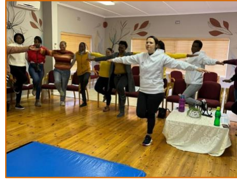
Images: Teachers and participants during the gross motor workshop.

All it took was a heartfelt letter from a mother with a Three-year-old, autistic boy expressing her vulnerability and challenges she faces with support and assistance for her son.