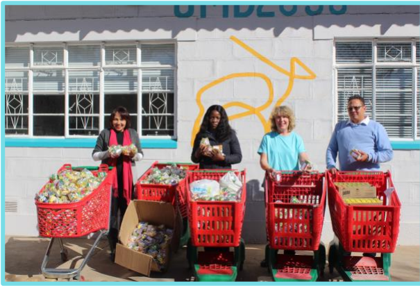
Donation handover to Oranjemund schools

In celebration of Day of the African Child, which is held on 16 June annually, OMD 2030 with the assistance of the Ministry of Gender donated 3 000 snack packs to children in the constituency.