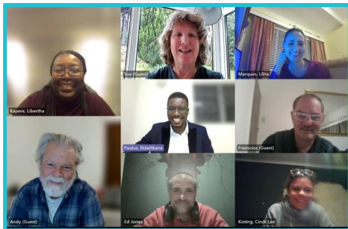
OMD 2030 Board Members Training

During May 2023, OMD 2030 held its Annual General Members (AGM) meeting, during which potential board member candidates campaigned for a seat at the table.