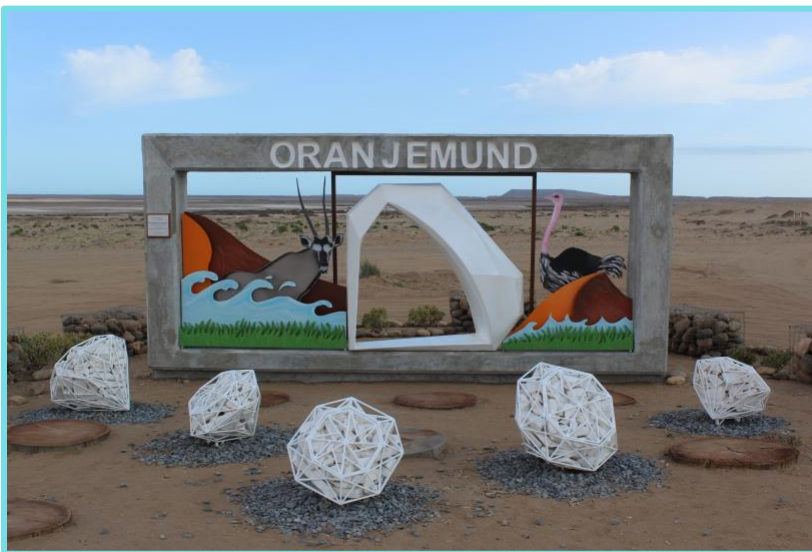
Oranjemund welcome sign at town entrance

OMD 2030 is an independent Community Association and the Citizenry Partner of the Oranjemund Town Transformation Programme. Our role within this project is to encourage and facilitate active citizenry involvement in co-creating a sustainable, economically diverse, and culturally rich town.