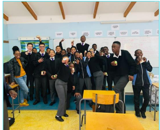
Learners from !Garibams Secondary School