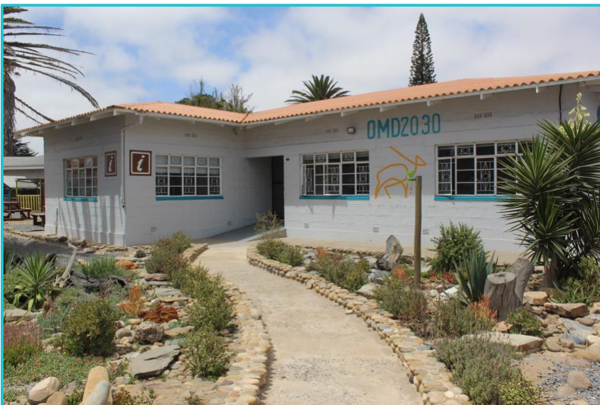
OMD 2030 Tourist Information Centre

OMD 2030 is an independent Community Association and the Citizenry Partner of the Oranjemund Town Transformation Programme. Our role within this project is to encourage and facilitate active citizenry involvement in co-creating a sustainable, economically diverse, and culturally rich town.