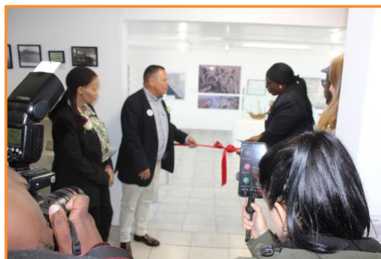
Official ribbon cutting by Hon. Faustina Caley

The shipwreck room is now home to artefacts from the Bom Jesus shipwreck. Some of the artefacts you will find in the room are copper ingots, lead and tin ingots, 1529 world map, ivory, coins, navigating tools and life on board – kitchenware items.