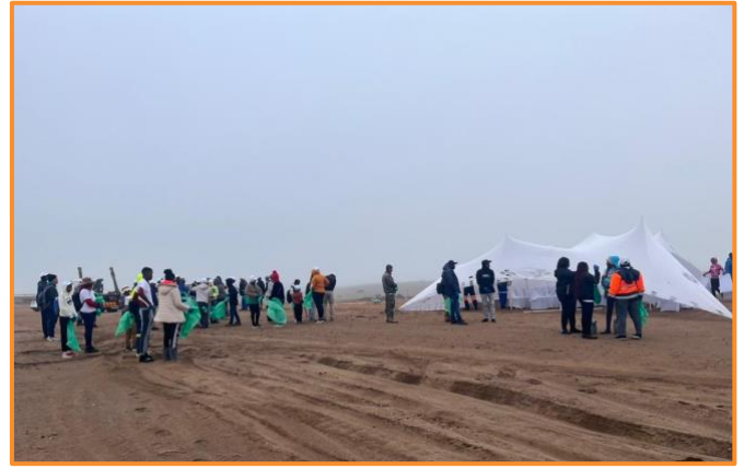
Beach clean-up campaign

World Oceans Day (WOD) is annually celebrated on the 8 th of June. This year it was celebrated under the theme - “Catalyzing Action for Our Ocean & Climate”, intending to raise awareness about the importance of oceans and marine life and seek ocean conservation efforts to encourage sustainable management of aquatic resources.