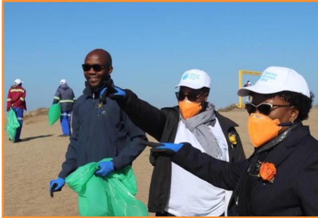
Deputy Minister of Fisheries and Marine Resources