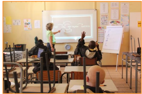
Resilience session at AAPS

The sessions were held at various schools, engaging students in meaningful discussions and interactive activities that promote resilience.