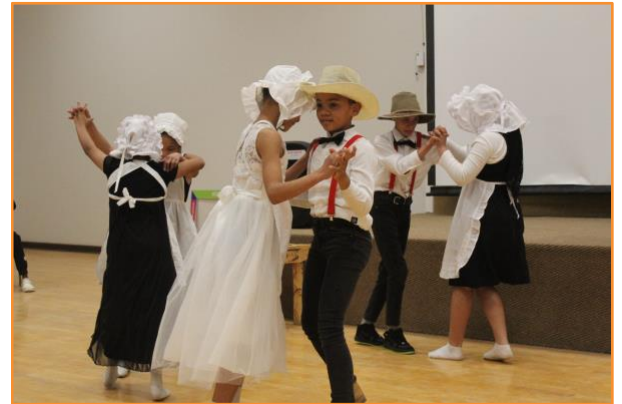
Baster cultural group performance

Through these shared experiences, the importance of preserving and honoring cultural traditions was emphasized, making Heritage Week a significant occasion in the Namibian calendar.