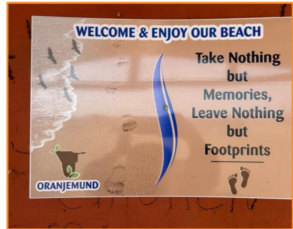
Anti-littering signage in braai bungalows

As part of our ongoing commitment to preserving the beauty of our town, OMD 2030 , in collaboration with OMDis and the Oranjemund Town Council , has launched an initiative to install anti-littering signage at our beach and the Swartkops Hill viewing point.