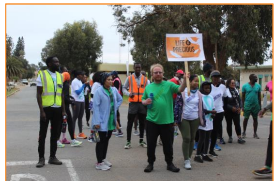
Mental Health Awareness Run

OMD 2030 extends its heartfelt gratitude to the Namdeb Wellness team, Yoga & Movement, and individuals whose contributions have been essential in coordinating these community events.