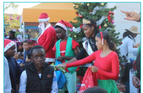
Photos: Scenes from the Festive Night Market