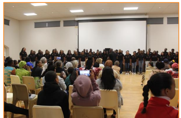
UNAM Choir performance