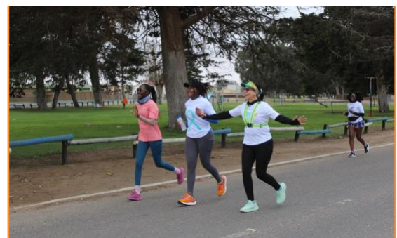
Mental Health Awareness Run