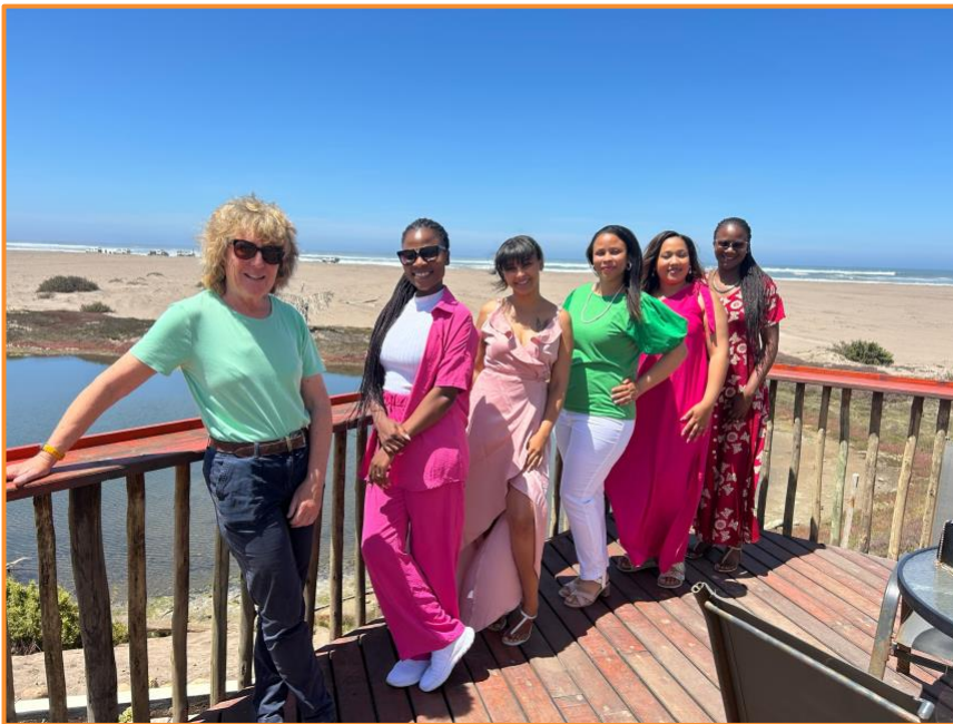
OMD 2030 Operations team