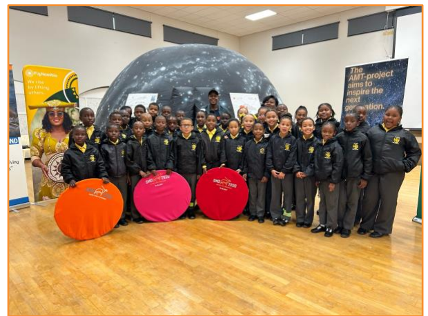
UNAM Planetarium with AAPS students