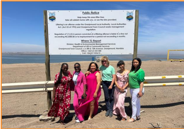
Anti-littering signage at river mouth